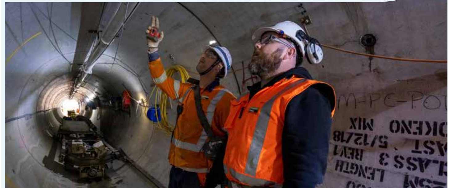
Final stretch of pipe being laid at our Ranfurly Road site for the 31km Hūnua 4 Watermain project.

Bringing you news, updates and information from Watercare