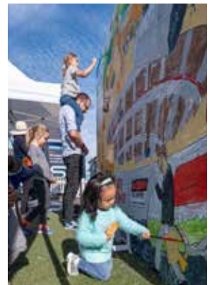
Visitors helped with our colourful mural