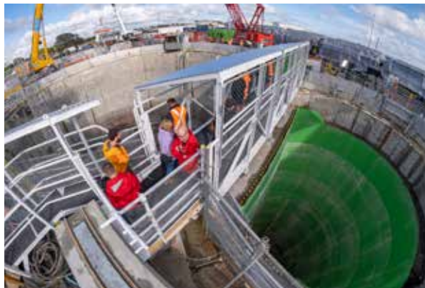
Visitors could view both shafts from the specially-built platform