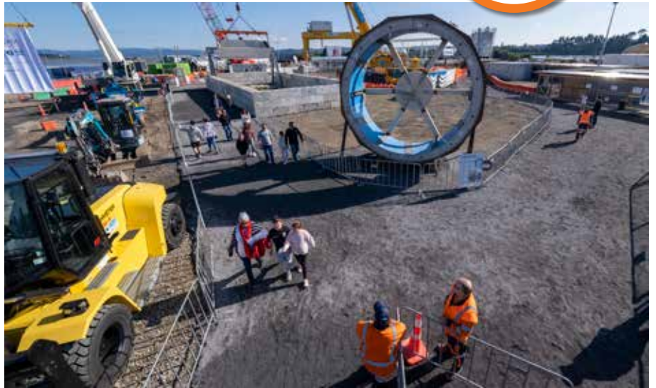
Alongside construction equipment we assembled a full-sized tunnel segment ring

It was great to see mana whenua, local elected members, industry leaders and the community come along to gain a better understanding of the work we have been doing and to see just how large this project is. Visitors were able to get up close to the equipment we're using on the project and view the 38m deep shaft from a specially built platform.