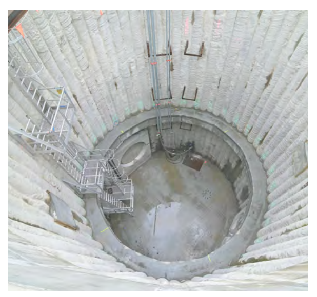
Miranda Reserve shaft