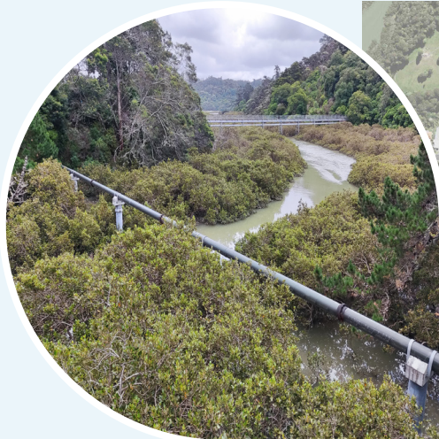
Existing wastewater pipeline over the Kaipatiki Creek.