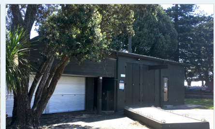
Existing Sidmouth Street Wastewater Pump Station.