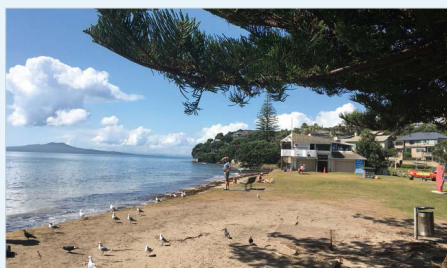
Mairangi Bay Beach.