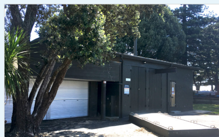
Existing Sidmouth Street Wastewater Pump Station.