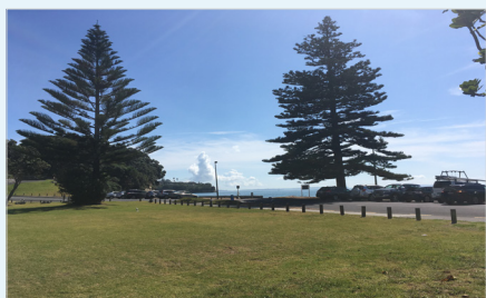
Mairangi Bay Reserve.

If you would like to receive notice of project updates please email 'sign me up' to MairangiBay@water.co.nz