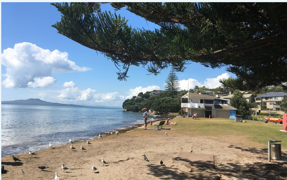
Mairangi Bay beach.

If you would like to receive notice of project updates, please email 'sign me up' to MairangiBay@water.co.nz