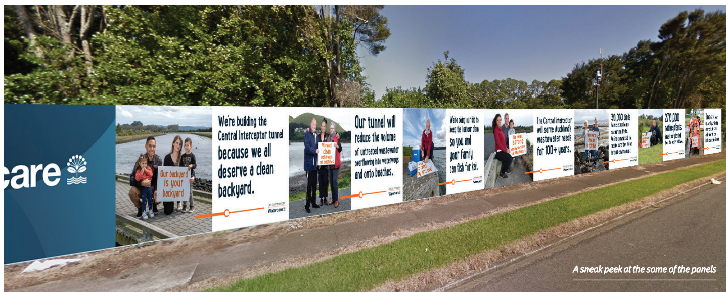
A sneak peek at the some of the panels

Over the next two months, we will install fencing and signage around the site perimeter. The signage features local residents telling us what's important to them: we've responded with how the Central Interceptor will help.