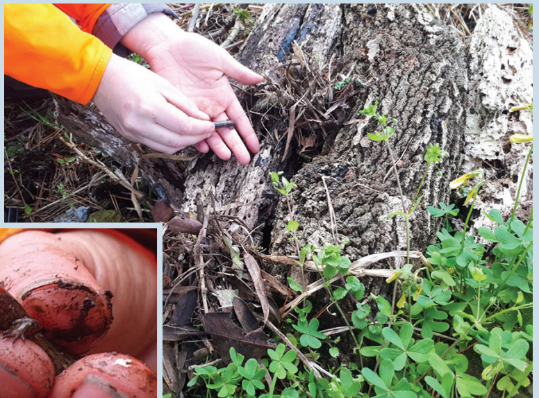
Collecting one of the native copper skinks

So far, we have rescued some 75 copper skinks and trapping will continue through December. A big thanks to May Road Primary School for rehoming two skinks on their grounds. We know they will be in safe hands.