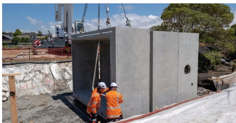
Installing the culvert in November

To create the access from Roma Road, we are building a new bridge over Oakley Creek. This is a complex operation, with five large concrete box culverts placed in the stream (see below), strong enough for trucks to drive over without affecting stream flows.