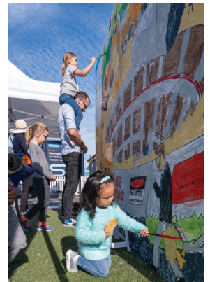
Visitors helped with our colourful mural