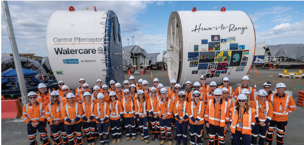
Arrival of the TBM