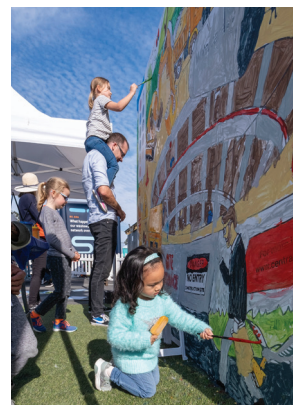
Visitors helped with our colourful mural