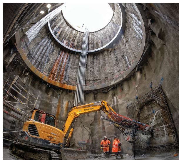
Dundale Avenue Shaft