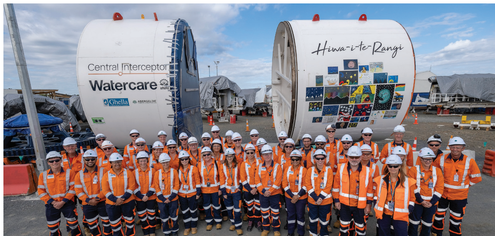
Arrival of the TBM