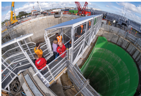
Visitors could view both shafts from the specially-built platform