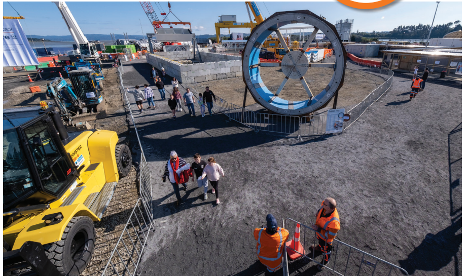
Alongside construction equipment we assembled a full-sized tunnel segment ring

It was great to see mana whenua, local elected members, industry leaders and the community come along to gain a better understanding of the work we have been doing and to see just how large this project is. Visitors were able to get up close to the equipment we're using on the project and view the 38m deep shaft from a specially built platform.