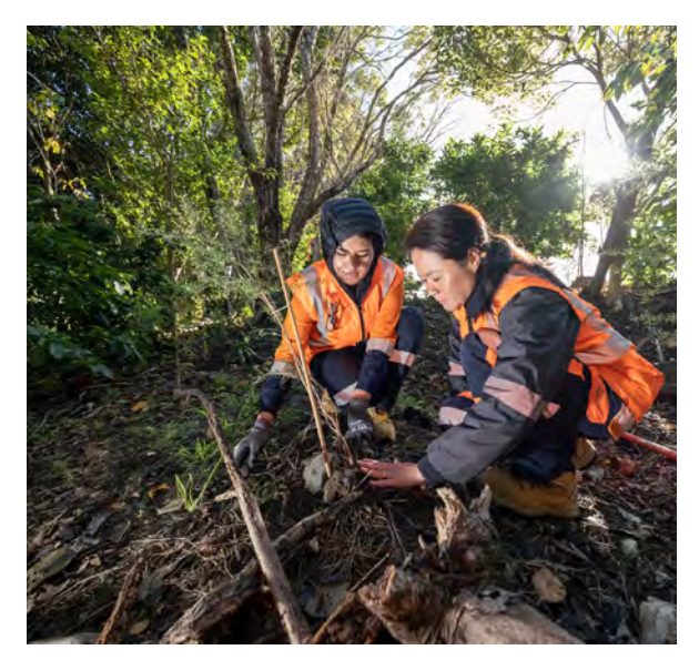
Tree planting in June in preparation for site works