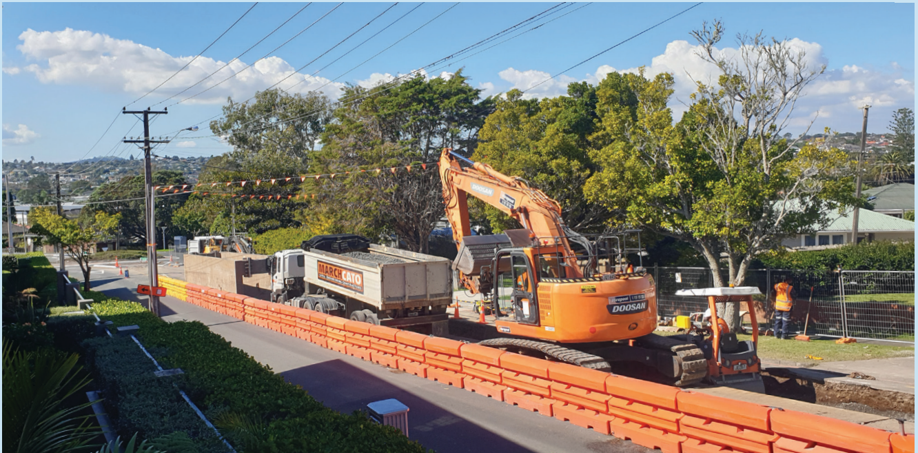
Pipeline trenching taking place on Golf Road section of the replacement Huia no.1 watermain.