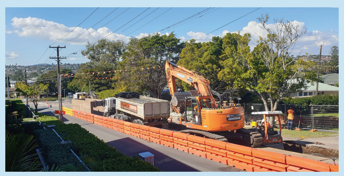
Pipeline trenching taking place on Golf Road section of the replacement Huia no.1 watermain.