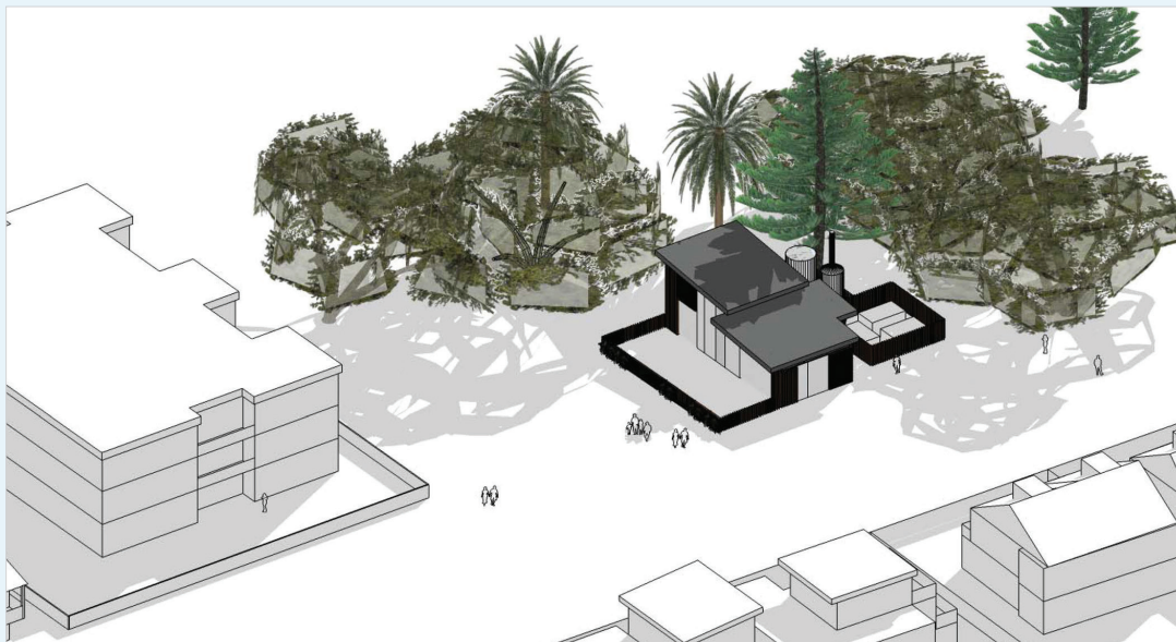
Artist's impression of what the replacement Sidmouth Street Wastewater Pump Station could look like.

Due to an increase in population and wastewater, the current wastewater pump station is struggling to cope, particularly during heavy rainfall when diluted wastewater can overflow up to 10 times per year, approximately 70 metres out to sea at engineered points on either end of Mairangi Bay. The new pump station will include larger pumps as well as additional underground storage where wet weather flows are able to be temporarily held until they can be pumped into the network, virtually eliminating overflows.