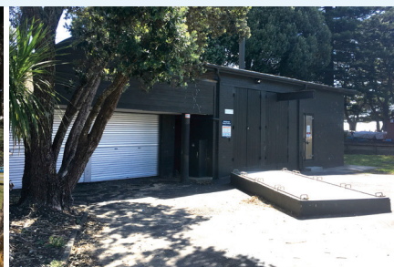
Existing Sidmouth Street Wastewater Pump Station.