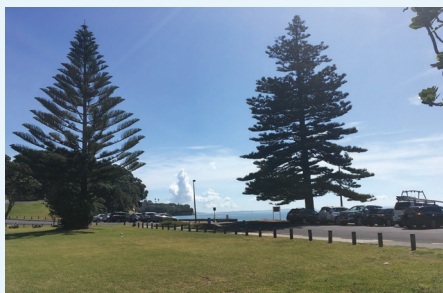
Mairangi Bay Reserve.

If you would like to receive notice of project updates please email 'sign me up' to MairangiBay@water.co.nz