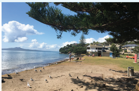
Mairangi Bay beach.