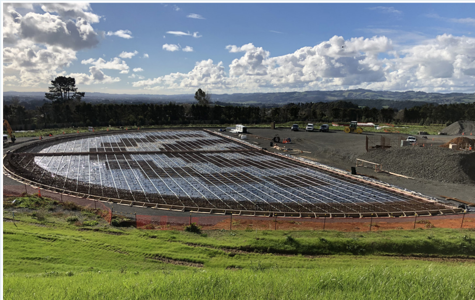
Construction of the reservoir floor slab.

Providing resilience to Auckland's drinking water supply