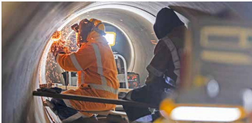
The final spark - the last section of a 31-kilometre pipe is put in place for the Hūnua 4 Watermain project.

Bringing you news, updates and information from Watercare