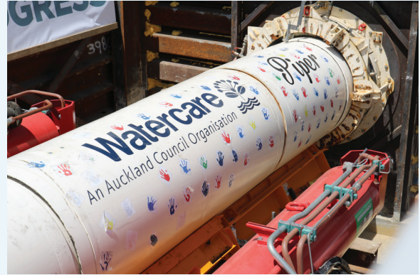
Tunnelling has progressed well, completing 1,036m of the 2km drive, progressing around 25mm/minute.

Works have also started in the marine environment, taking advantage of the settled weather, dredging the sea trench and TBM reception pit. At the completion of the tunnelling drive a diffuser pipe string will be towed from another location, sunk in place and connected to the tunnelled section of pipe.