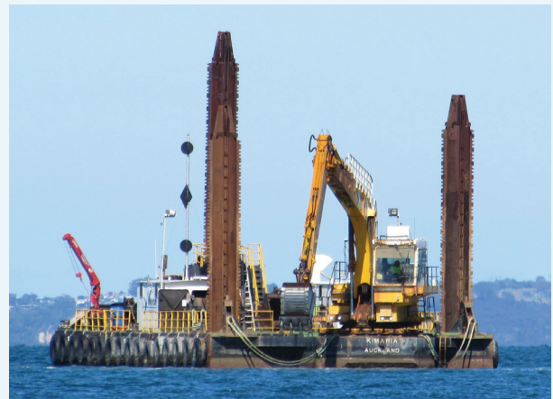
Marine outfall dredging works off the Mahurangi East Peninsula.