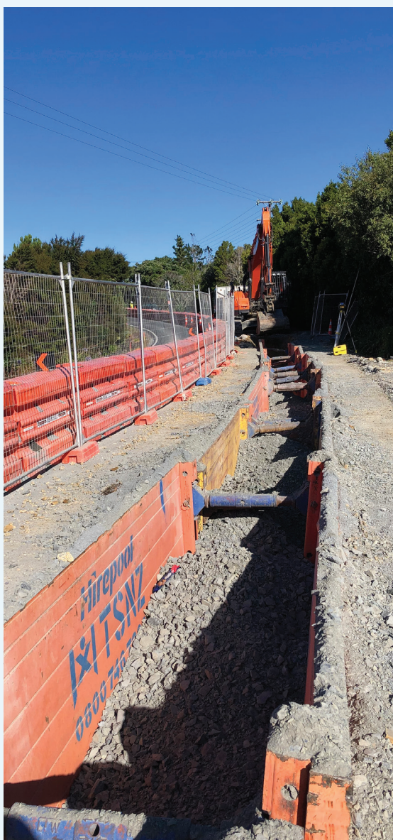
Open trenching Martins Bay Road.

Traffic layout changes are in place while this takes place and we ask that you follow the rules to ensure the safety of our communities and contractors. Only green means go, and please stick to the speed limit of 30km/h.