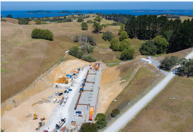
TBM launch site, Miller Way.

Works have also started in the marine environment, taking advantage of the settled weather, dredging the sea trench and TBM reception pit. At the completion of the tunnelling drive a diffuser pipe string will be towed from another location, sunk in place and connected to the tunnelled section of pipe.